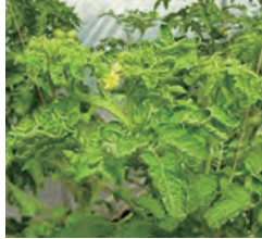
Tomato yellow leaf curl virus

Viruses cause infectious diseases in various agricultural crops.