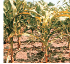
Wheat streak mosaic virus