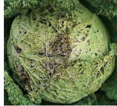
Turnip yellow mosaic virus